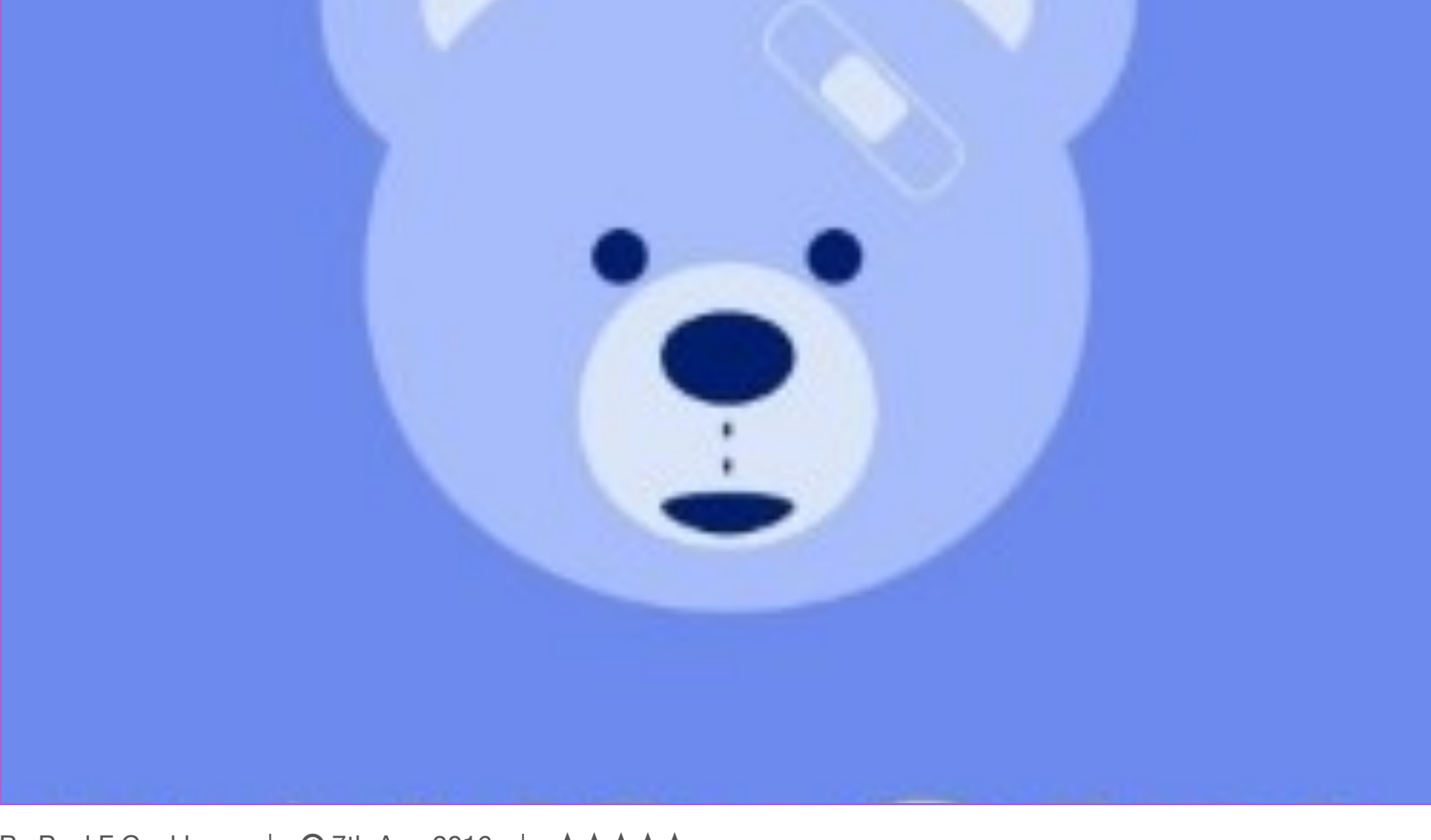
By Paul F Cockburn | 7th Aug 2016 | ★★★★★

T rust me, Fringe magic still happens. Just when you least expect it, you stumble upon a rough little diamond of a show, lurking within the depths of an old church, even early in the day. Pittsburgh-based Grandview Theatre Group's version of Dani Girl may be legally designated as an 'amateur' one, but it's a production bursting with vitality (despite its undoubtedly morbid subject), exuding compassion and performed with speed, economy and a determination to never shirk from the cathartic.