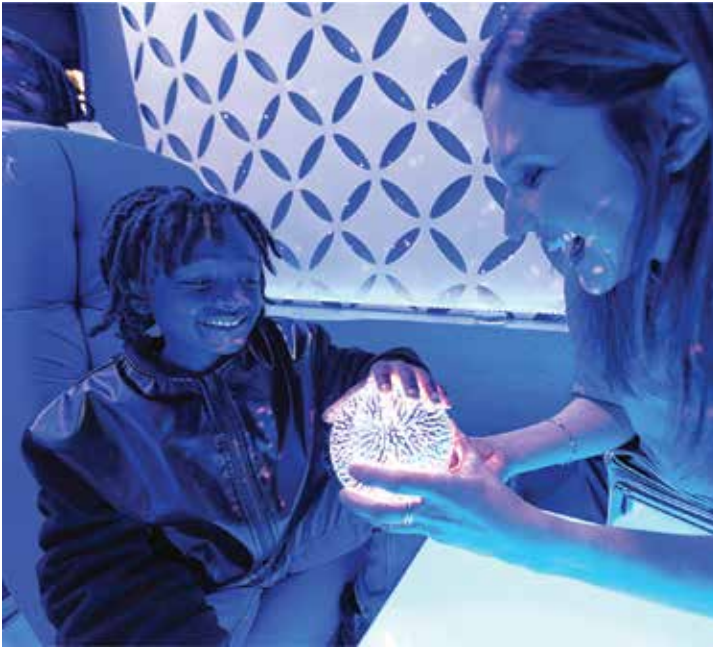
An audience member, also known as the "Recruit" explores the stars inside of the Mobile Sensory Theatre with Aster the Starkeeper

In time, we plan to create additional experiences that will tour Omaha and beyond. These shows will be created through residencies and workshops in autism-support classrooms, and with the help of actors, designers, and writers with disabilities.